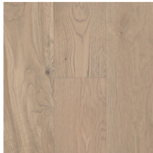
NAUTICAL OAK BCE03-32