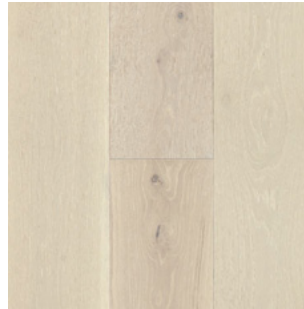
SEASPRAY OAK BCE03-29