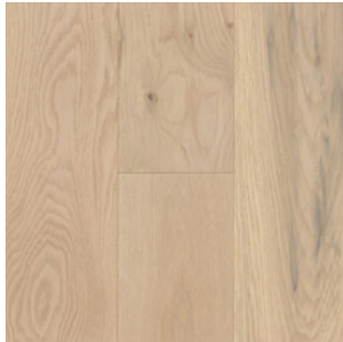
BEACHWOOD OAK BCE03-27