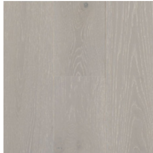
COMPASS OAK BCE03-28